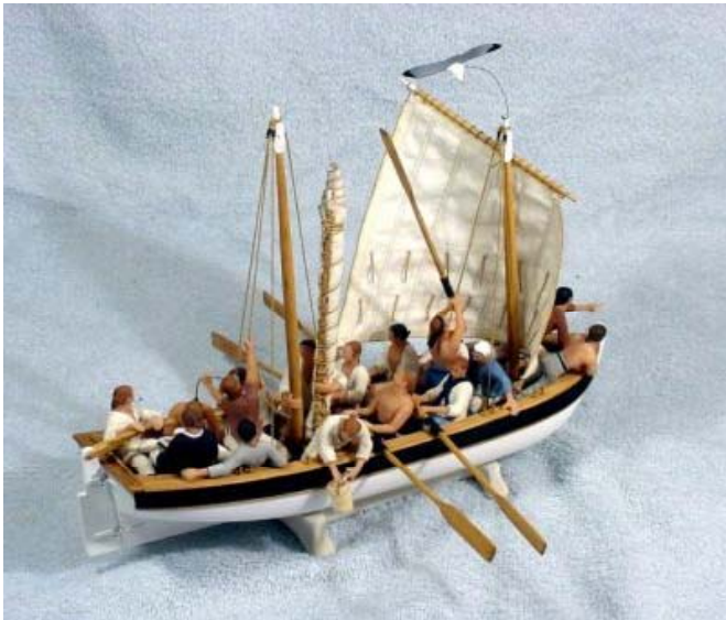
Scale Model of the Bounty Launch

Half of the crew remained loyal to Bligh, but mutineers had the drop on them. They had the muskets. Bligh along with 19 loyalists were put to sea aboard the Bounty's launch.